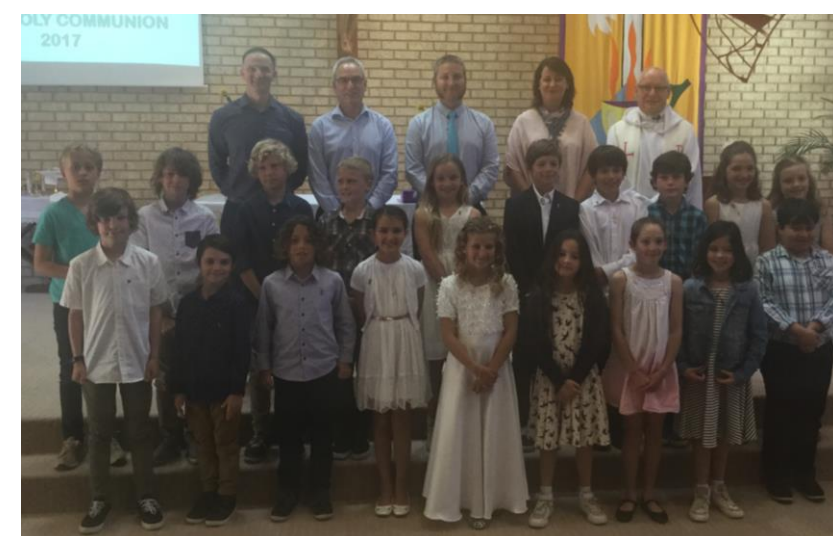
First Holy Communicants 5 th November 2017